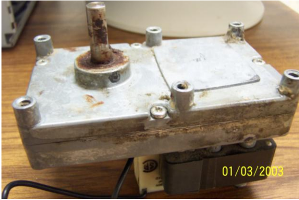
Old Auger Motor has longer screw holes so you need spacers for old brackets