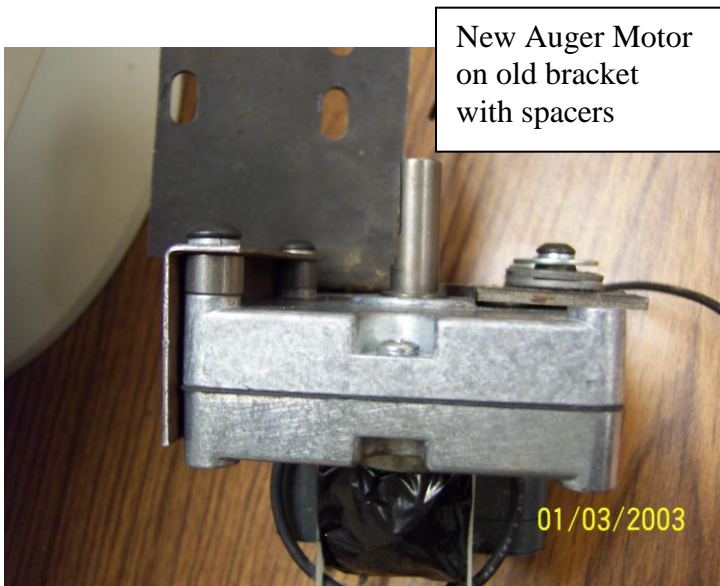
New Auger Motor on old bracket with spacers